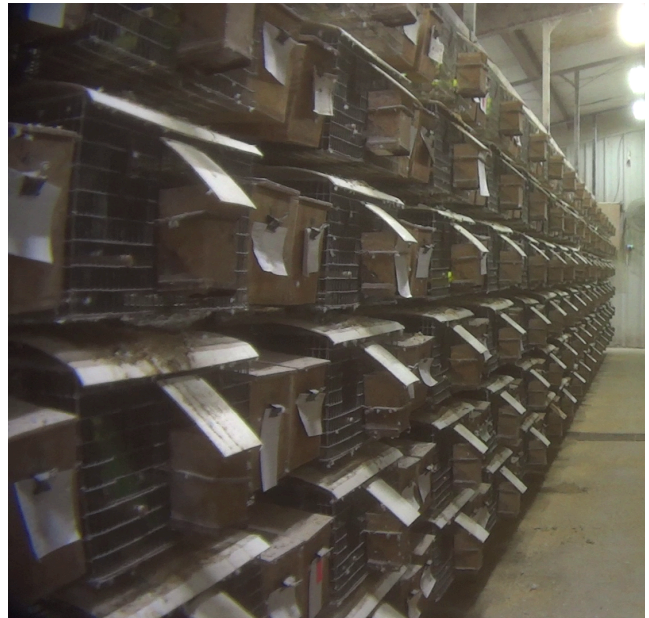
Thousands of parrots sit in cages at a mill in Oklahoma. Parrot mills are similar to factory farms, where egg-laying hens are confined in battery cages.