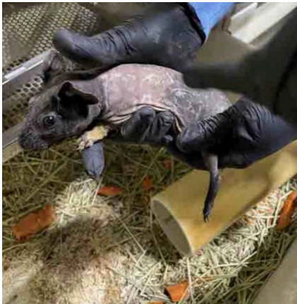
A guinea pig with skin lesions at Sun Pet, a notorious animal dealer that supplies Petco and other pet store chains. Photo taken by USDA inspector.