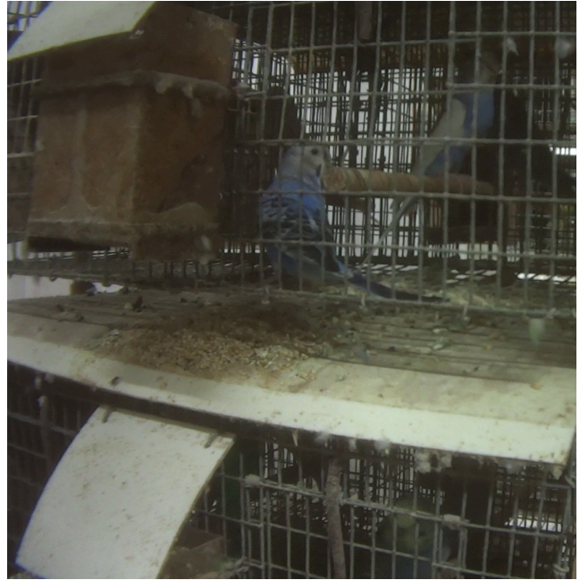
Parrots in cages coated with feces and loose feed.