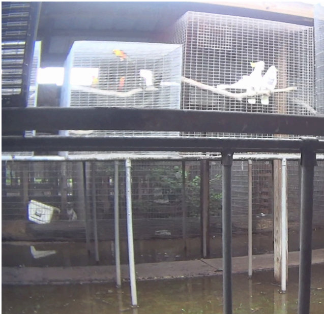
Cockatoos in outdoor cages suspended over mud and water.