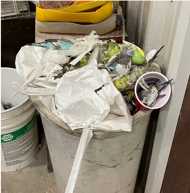
A trash can overflowing with dead parrots. The mill owner stated he suffocates birds he can't sell in a plastic bag.