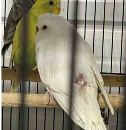
Parakeets with feather loss and scabbing at Sun Pet.