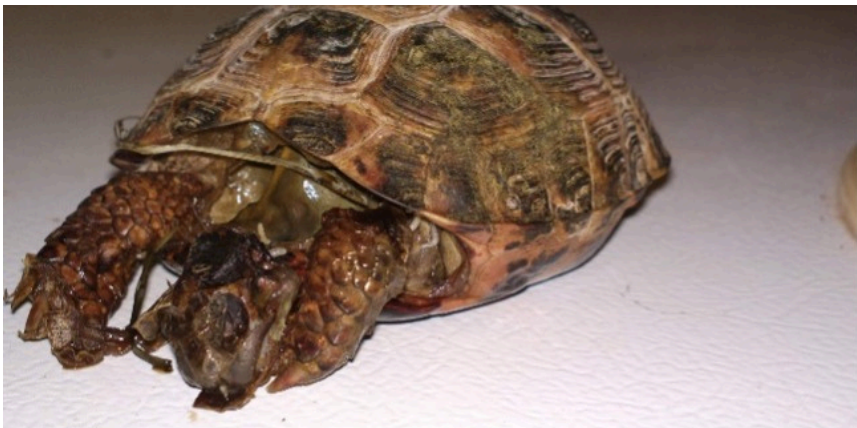
A dead and rotting Russian tortoise found in an enclosure with 14 living turtles at Reptiles by Mack, a reptile supplier that supplies Petco and PetSmart.