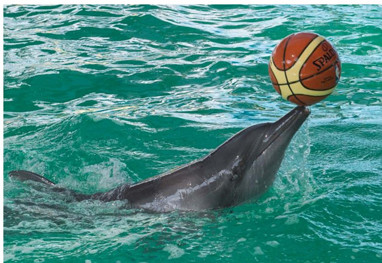
Below: Dolphins are kept captive in small pens or pools where tourists can interact with them.

World Animal Protection, AWI, and other animal protection groups maintain that a plethora of information is available clearly indicating that marine mammals do not cope well with captivity and it is impossible for marine mammals to thrive, not just survive, in such conditions. Taking animals from the wild or breeding animals in captivity for the purpose of human entertainment, despite the inherent suffering it causes for the individuals, raises serious ethical concerns. Marine mammals are denied freedom and autonomy and their captive environments provide a stressful life which has nothing in common with the life for which they evolved and adapted. Furthermore, the public display industry cannot be justified on the grounds of conservation or education value. The report concludes that it should be unacceptable for these animals to be held in captivity for the purpose of public display throughout the world. For marine mammals - such as cetaceans whose intelligence appears at least to match that of the great apes and perhaps of human toddlers (they are self-aware and capable of abstract thinking) a life in captivity is simply no life at all.