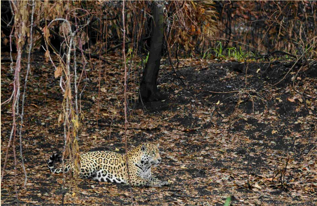
Iconic wildlife like the jaguar and its habitat are at risk from JBS and its relentless drive to expand destructive, unsustainable factory farming.