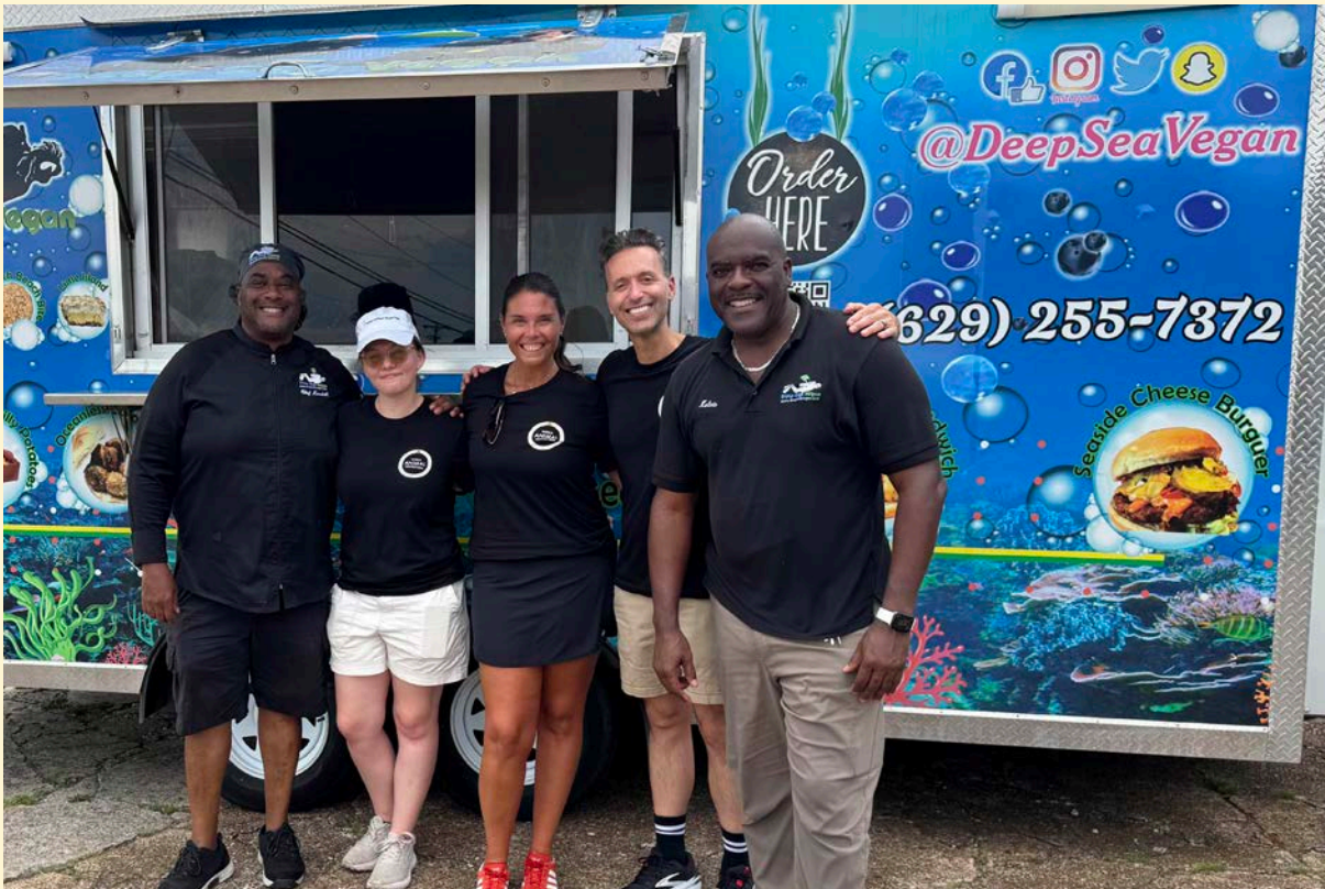
Deep Sea Vegan, a mobile food truck brand in Nashville, TN, joined our Dine Vegan Nashville event where they handed out over 400 samples of delicious vegan seafood.