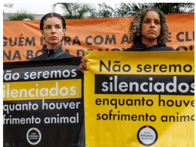
Activists in Brazil with banners that read: "We will not be silenced as long as there is animal suffering".

As preparations for this year's COP 30 (the 2025 UN Climate Change Conference) are ramping up in Brazil, JBS is brazenly continuing to destroy the environment and exploit animals. We remain committed to mobilizing supporters and the public to put pressure on governments and financial institutions to acknowledge the unmistakable truth about JBS.