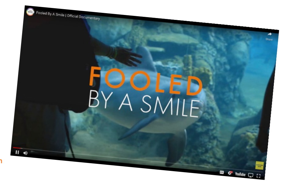
See the movie here: http://tiny.cc/dolphin-film

In September, we released our documentary titled Fooled By A Smile about dolphins held in captivity. It features Lorena López, a former trainer speaking out to be a voice for the voiceless.