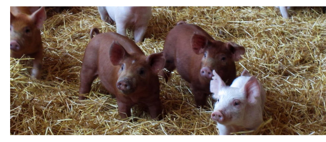
Above: Pigs at Niman Ranch, a high welfare farm in the US.

Sign our petition demanding the US government strengthen regulations now: worldanimalprotection.us/fda-reduce-use-antimicrobial