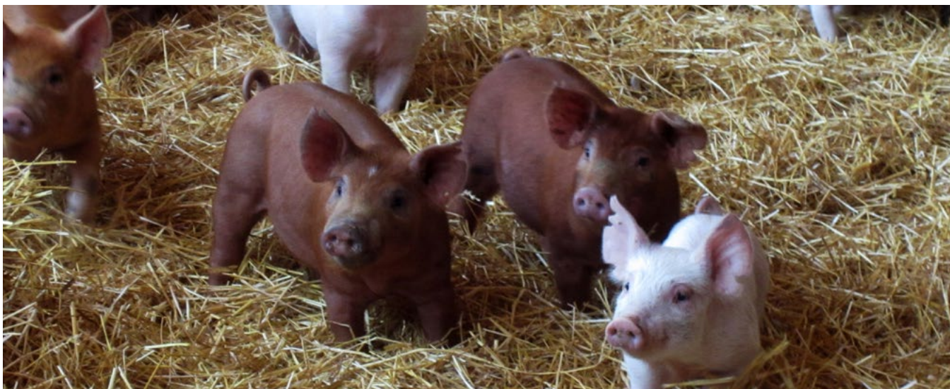
Above: Pigs at Niman Ranch, a high welfare farm in the US.